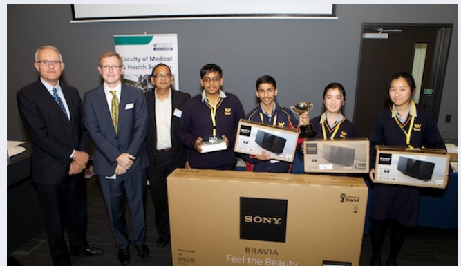
The 2014 Roskill Team being presented with their prizes