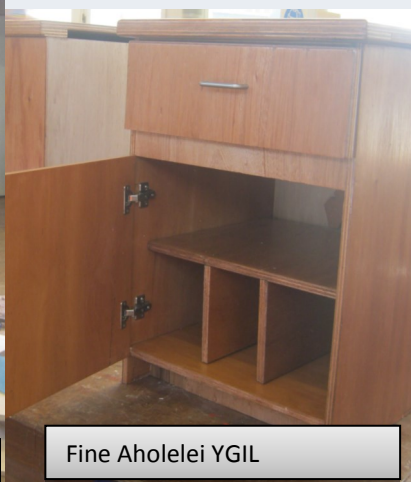
Fine Aholelei YGIL