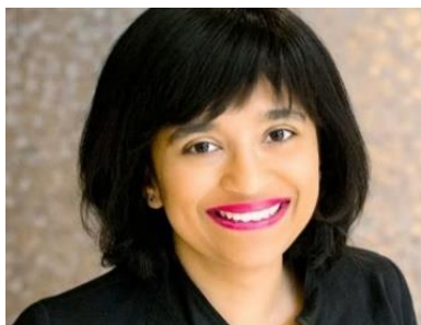
Nalini Singh [1995], Author

Nalini Singh is a New York Times best-selling author 30 times over. She has written 45 books since her first novel Desert Warrior was published in 2003 and is frequently spotted on the USA Today and Der Spiegel bestseller lists as well.