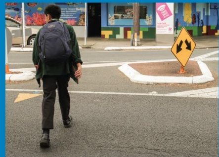
Mt Roskill Grammar students crossing Frost Road by the roundabout island.