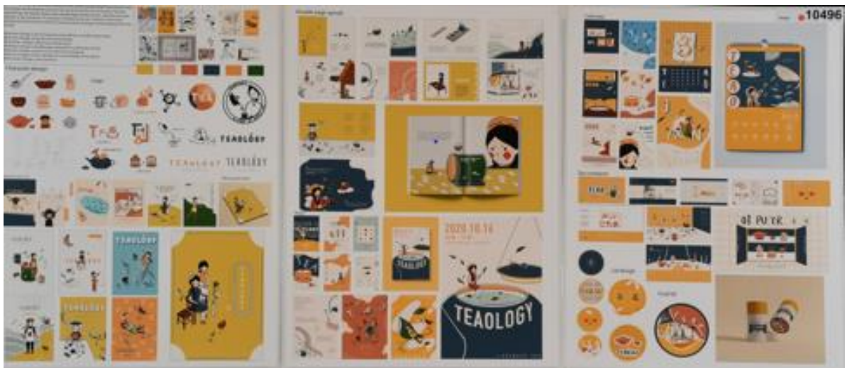
Sharon Liang, 2020

Congratulations to Sharon Liang a Year 13 design student in 2020 who is included in the NZQA Top Art Exhibition 2021. The exhibition features exemplary Level 3 Visual Art portfolios and tours across New Zealand. The exhibition will be showing in Auckland at Whitecliff School of Arts, 12-16 July 2021.