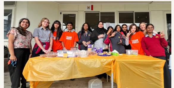
House committee fundraisers - Cooper and Ngata Houses hosting bake sales at H Block.