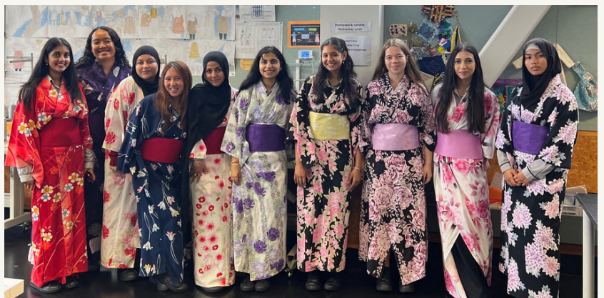
Visitors from the Japanese Consulate brought kimonos in for the Year 12 & 13 DSM class to practice putting on and wearing.