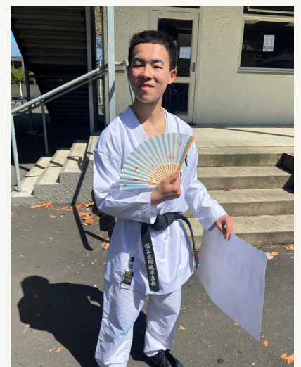
Japan Day was hosted by the visiting Fukuoka Jyoto High School students. MRGS students participated in traditional Japanese games and won prizes such as origami cranes and toys.