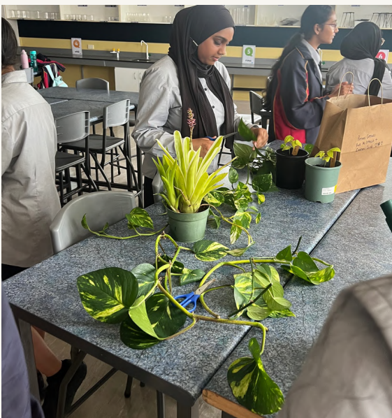
A generous donation of fresh Pothos cuttings and other plants from a MRGS parent to the Plant Club.