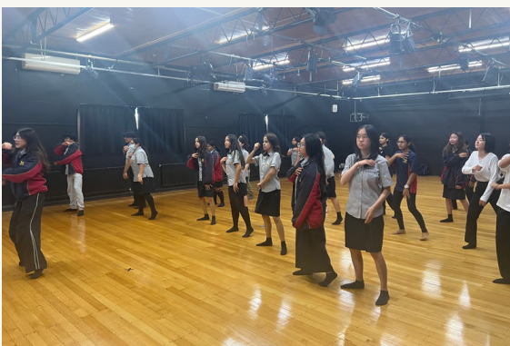
K-pop dance group learning a new dance.