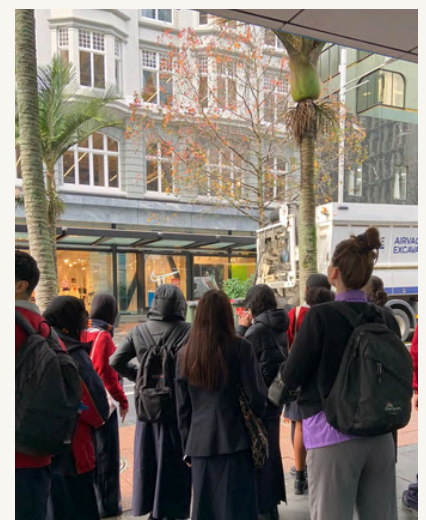
On June 11, Year 12 Classical Studies students had a great day exploring the Auckland CBD and War Memorial Museum to learn more about Classical architecture found in Tamaki Makaurau.