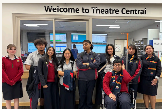
Year 12 Health Science Academy Students visiting Middlemore Hospital's units.