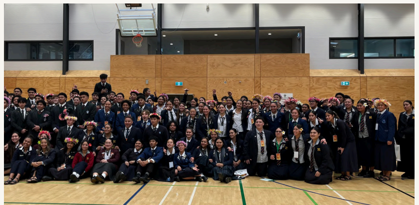
MRGS students attended the Pasefika Leadership Conference at Dilworth College on Friday 14th of June.