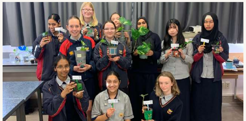
Students in the Plant Club potted plants and decorated them to give to teachers, friends, and family.