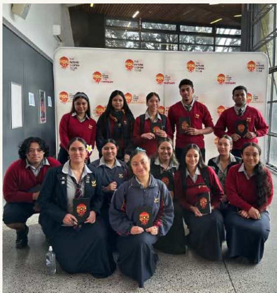
Year 13 Health Science Academy Leadership Conference on Tuesday, 25th of June.