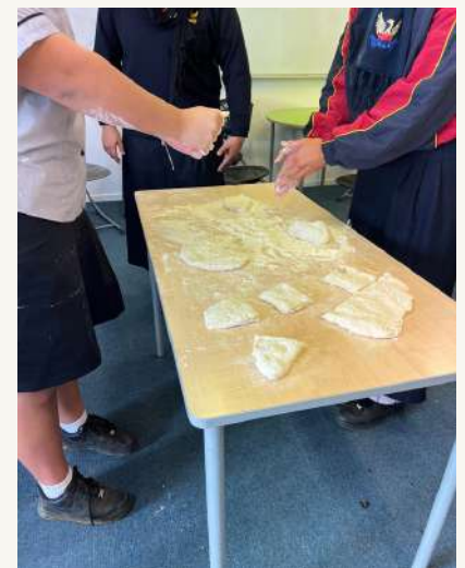
Matariki brings us all together to create something new, such as planting a garden and gathering to share kai, which was what our taura did in their workshops on 26th of June.