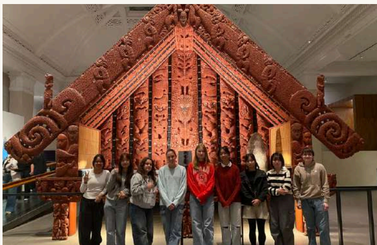
Term 3 international students visited Mount Eden, Auckland Museum and Sylvia Park for an orientation trip.