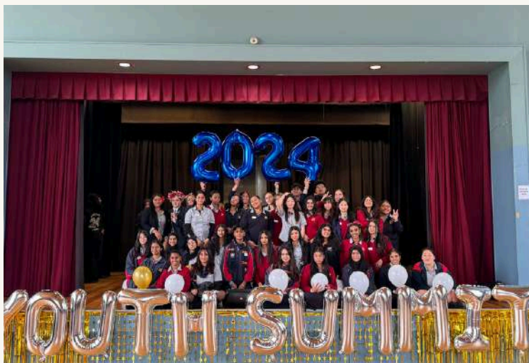
Students attended the Puketapapa Youth Summit.