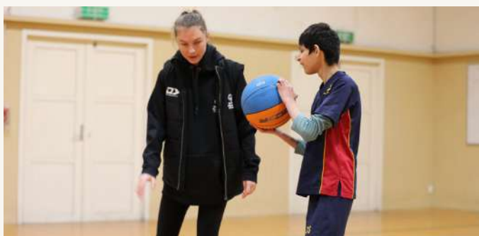
MacLean Centre students are training hard for their Special Olympics Basketball Tournament.