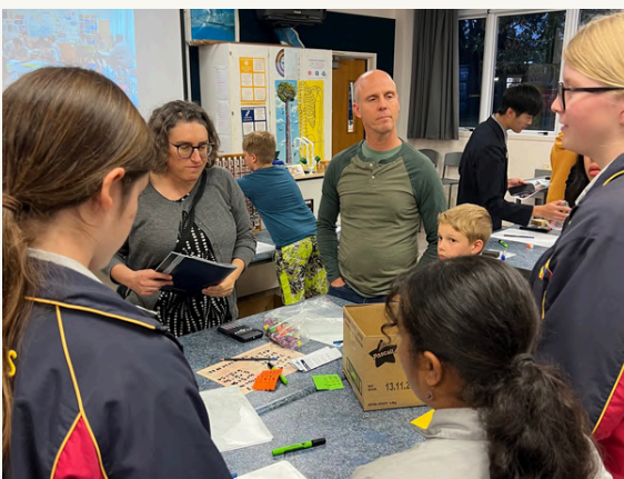
On 14 May, we welcomed prospective students and their whānau to our school grounds on our Open Day.