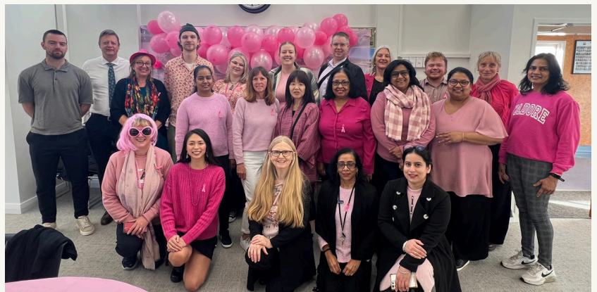
On 22 May, MRGS staff came together to host a Pink Ribbon Breakfast in the staffroom to raise vital funds for Breast Cancer.