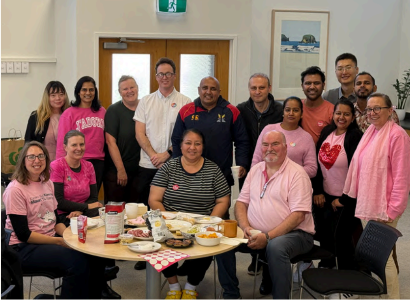
Support Staff Day is dedicated to appreciating the contributions of various support staff in schools and educational institutions.