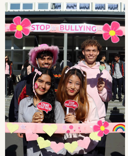
Pink Shirt Day was held on 16 May. Kōrero Mai, Kōrero Atu, Mauri Tū, Mauri Ora - Speak Up, Stand Together, Stop Bullying!