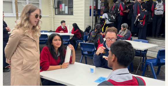
Consent Awareness Week - Consent Cafe was a space for students to talk about all things consent.